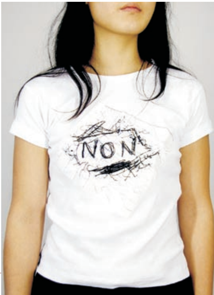
Laetitia Bourget NON 2002