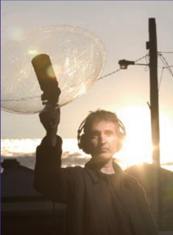
Philip Samartzis Captured Space 2005

Philip Samartzis' surround sound installation ' Captured Space ' (2005) was developed to change '... the acoustic dimension of Alliance Française through an imperceptible soundtrack that (unheard or even forgotten) forms densities of space and newly developed aural zones through latent sounds. ' Captured Space ' interacts with the sounds of the location to render new and complex readings ... ' subtly subverting any perception of a seamless aural experience. Samartzis commingles the actual and daily sounds of the Alliance with introduced layers of recorded aural elements that ... permeate through acoustic spaces like perfume: refrigerator noises; fluorescent lights, computer hum, air conditioning; vibrating pipes; vending